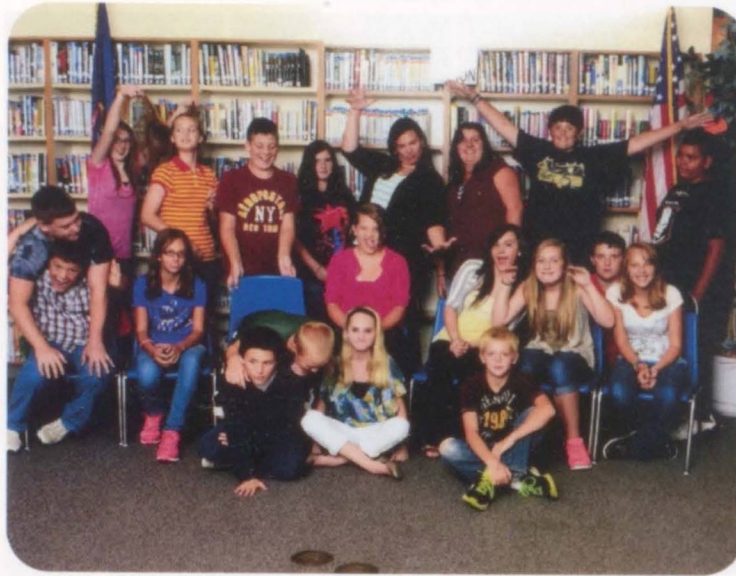
*What's normal?* The 7th graders are being silly as Dick's Studio takes their class picture.